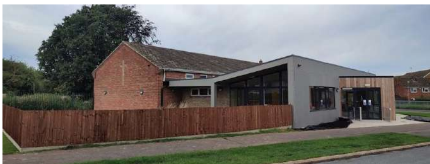
North Lynn Methodist Church—The Beacon