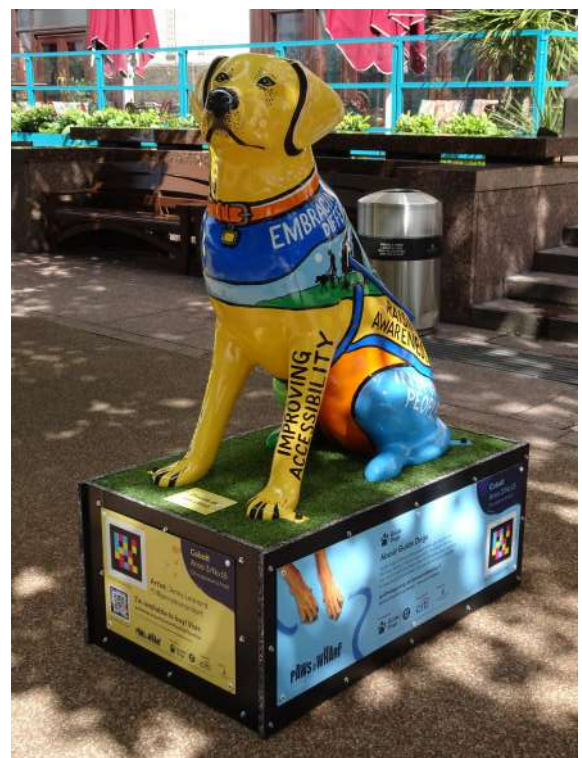
Guide Dogs Sculpture trail in London Docklands

reflect this. We need to understand different cultures and avoid feelings of cultural superiority. Churches can benefit from cross cultural learning so we can ensure all feel equally welcome. This session concluded by suggesting we need to accept we are all different, make a real effort to pronounce/spell people’s names correctly, attune our ears to understand the many different accents we encounter and avoid stereotyping people. Years ago I had a colleague with a broad Irish accent which I learnt to understand and I have not had any difficulty with Irish accents ever since!