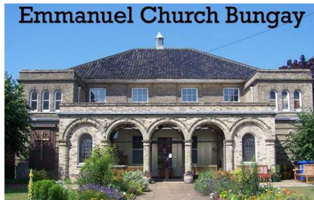
Emmanuel Church achieved their Gold Eco Church Award in 2022

We also collect used printer cartridges, old bras for Bra Aid, old spectacles for Vision Aid and kitchen roll tubes, Pringle lids & plastic bottle tops to sell on Ebay for art & craft materials. Many schools, groups and individuals buy them for their