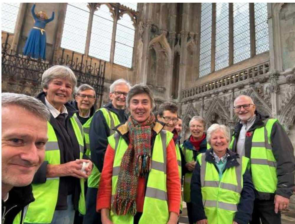
Litter pickers from Ely Methodist Church and the Cathedral enjoying a break in the Lady Chapel at Ely Cathedral.